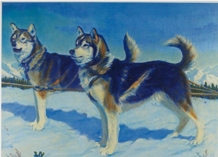
Dog Breed: Siberian Husky Artwork: They Opened the North Country Artist: Fred Machetanz Fun Fact: Siberian Husky sled dogs were used by the U.S. Army for arctic search and rescue missions during World War II.