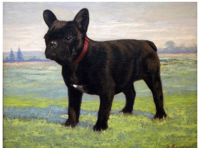
Dog Breed: French Bulldog Artwork: French Bulldog Artist: S. Raphael Fun Fact: French Bulldogs actually originate from England, and the popular companion of English lacemakers in Nottingham.